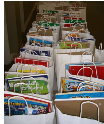
Tables full of dried soup jars and kits for children.