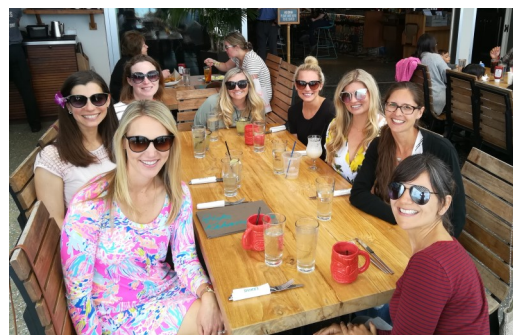
12 Moms were blessed and refreshed at our first annual MOPS retreat in La Jolla.

No meetings at church June-/July/August. Play dates and Mom's Night Out continue, see website for specifics.